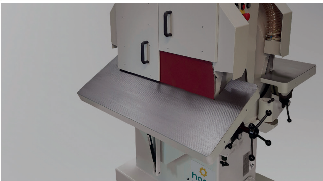
VERSION SS550 WITH SECOND DISC